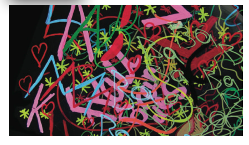
WORD · E · SCAPE Handwritten animated films set to live sound